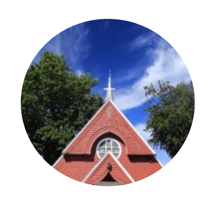
Follow us on Social Media